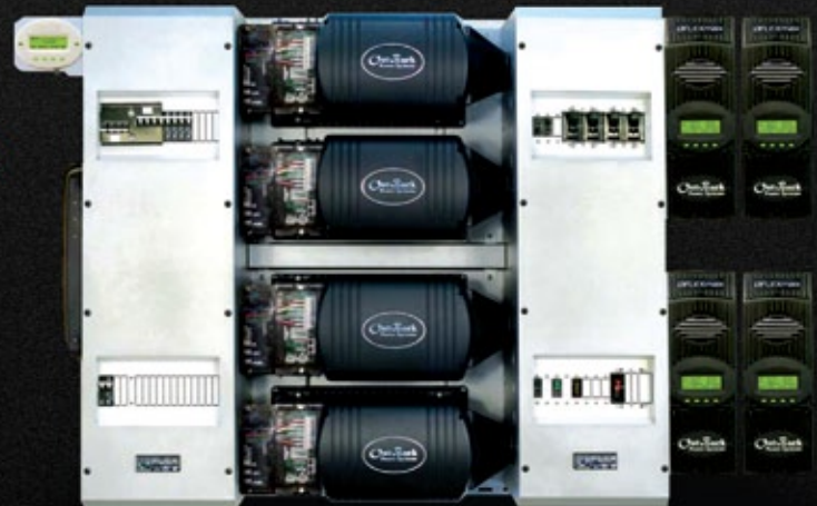
12 kW Power Pack