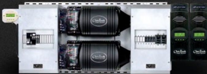
6 kW Power Pack